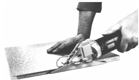
flush trimming of projecting edges with side guide.