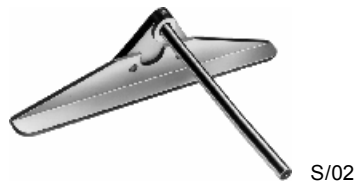
adjustable guide for cutting strips or edge-bands