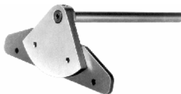
adjustable guide S/01 for straight cuts